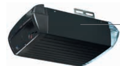
GTA 702 NRG

We continuously conceptualise, improve and develop garage doors ever further, often from scratch. TORMATIC operators combine the latest in technology with contemporary energy and resource efficiency at the very highest level. Their optimised designs, modern energy-saving LED lighting technology, stability and maximum performance are impressive and convincing.